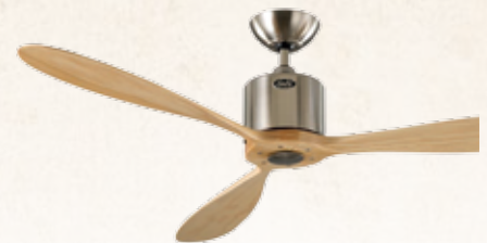
AEROPLANE ECO BN-NT #313247 housing brushed chrome, natural solid wood blades