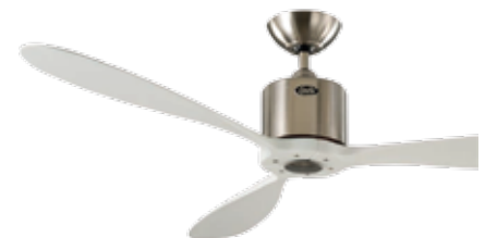
AEROPLANE ECO BN-WE #313248 housing brushed chrome, white solid wood blades