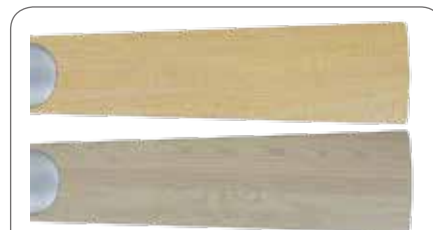
Interchangeable blades #19018 reversible wooden blades maple/chalked oak