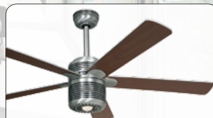
ALU AL #513218 housing brushed aluminium/reversible wooden blades silver grey/cherry (see picture)

ALU AL #513218 housing brushed aluminium, reversible wooden blades silver grey (see picture)/cherry