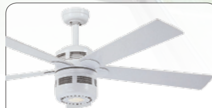
ALU WE #513219 housing aluminium white coated, blades white finish