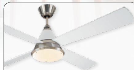
ECO CONO-L 132 BN-WE #413236 with light kit included, housing brushed chrome/white coated, with blades white finish