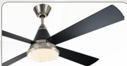
ECO CONO-L 132 BN-SW #413237 with light kit included, housing brushed chrome/matt black, with blades black finish