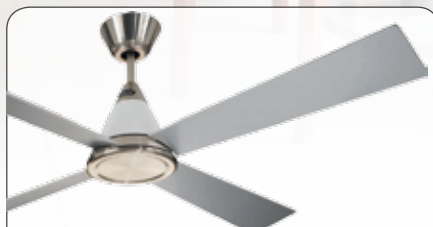
ECO CONO 132 BN-WE #413226 housing brushed chrome/white coated, with blades silver grey finish