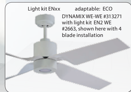
Light kit ENxx adaptable: ECO DYNAMIX WE-WE #313271 with light kit EN2 WE #2663, shown here with 4 blade installation