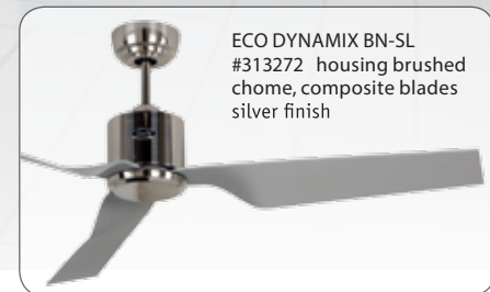
ECO DYNAMIX BN-SL #313272 housing brushed chrome, composite blades silver finish