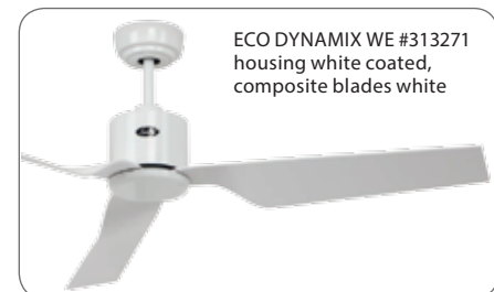
ECO DYNAMIX WE #313271 housing white coated, composite blades white

Radio remote control (motor 6 speeds, light dimming, forward/reverse switch) wall bracket included.