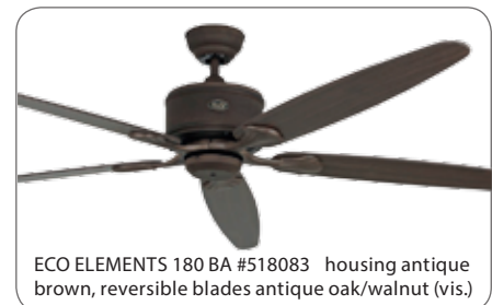
ECO ELEMENTS 180 BA #518083 housing antique brown, reversible blades antique oak/walnut (vis.)