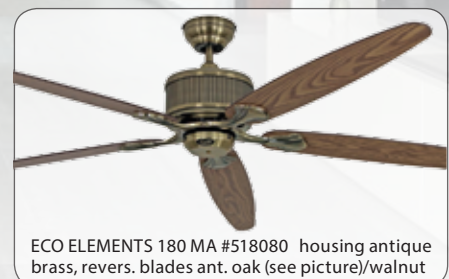
ECO ELEMENTS 180 MA #518080 housing antique brass, revers. blades ant. oak (see picture)/walnut