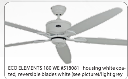
ECO ELEMENTS 180 WE #518081 housing white coated, reversible blades white (see picture)/light grey