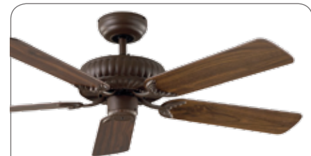
ECO IMPERIAL 132 BZ #513225 housing oil rubbed bronze, reversible blades antique oak (see picture)/walnut