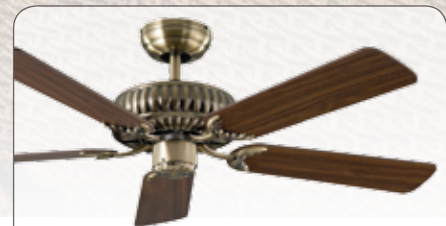
ECO IMPERIAL 132 MA #513224 housing antique brass, reversible blades antique oak/walnut (see picture)