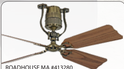
ROADHOUSE MA #413280 housing antique brass, here with 4 blades an- tique oak (see picture)/walnut #19601 , Ø132 cm