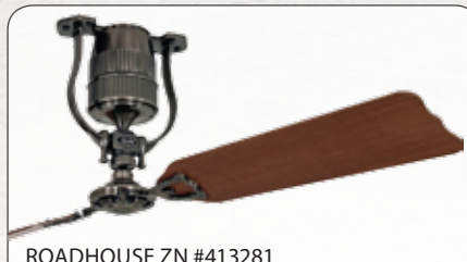
ROADHOUSE ZN #413281 housing pewter, here with 2 blades beech/ cherry (see picture) #19604 , Ø 152 cm