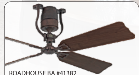
ROADHOUSE BA #41382 housing antique brown, here with 4 blades an- tique oak/walnut (see picture) #19603 , Ø152 cm