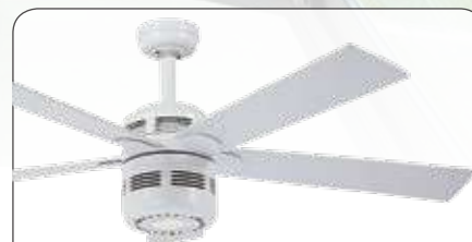
ALU WE #513219 housing aluminium white coated, blades white finish