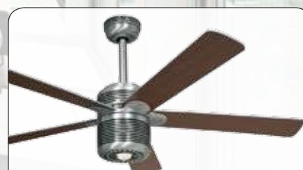
ALU AL #513218 housing brushed aluminium/reversible wooden blades silver grey/cherry (see picture)