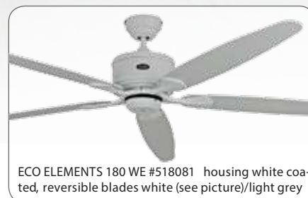
ECO ELEMENTS 180 WE #518081 housing white coated, reversible blades white (see picture)/light grey