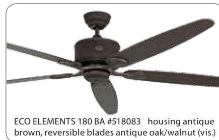
ECO ELEMENTS 180 BA #518083 housing antique brown, reversible blades antique oak/walnut (vis.)