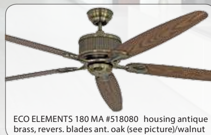
ECO ELEMENTS 180 MA #518080 housing antique brass, revers. blades ant. oak (see picture)/walnut