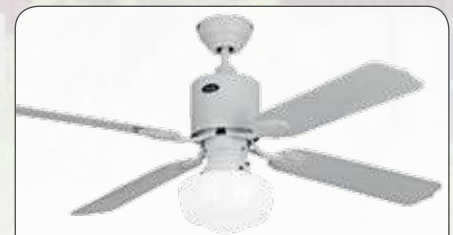
SOLAR BREEZE 12V WE #413257 housing white coated 4 ABS blades white, with light kit 1 #102571 E27, 12 V (see picture)