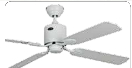
SOLAR BREEZE 12V WE #413257 housing white coated, 4 ABS composite blades white finish